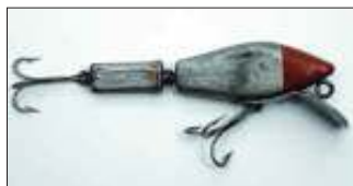
From 'A Million MirrOLures'

Those lures, and the stories of their inventors, are lovingly reproduced in "A Million MirrOLures: The