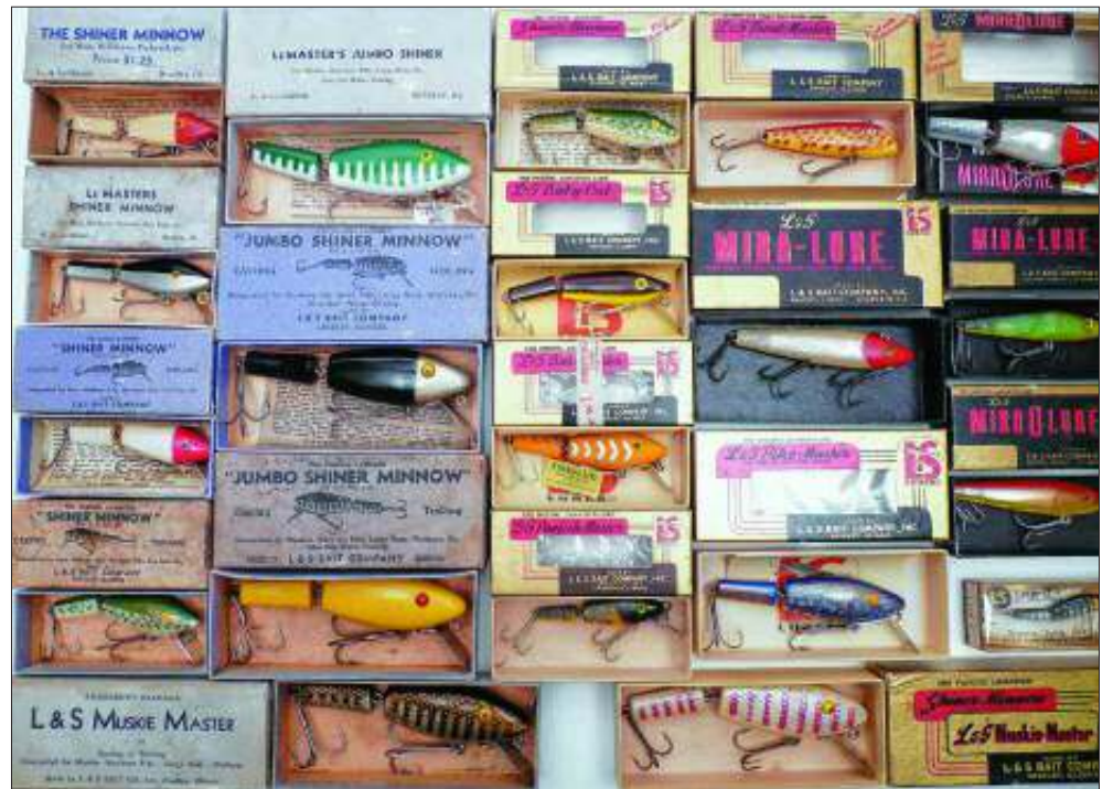
From 'A Million MirrOLures'

He began selling, first directly to area fishermen and then in hardware stores. For three years, all the lures were hand-carved. Tenite plastic arrived in 1940, the first in a long series of changes that gradually transformed the line by adding color, variety, realistic eyes and a reflective body (hence the name MirrOLure).