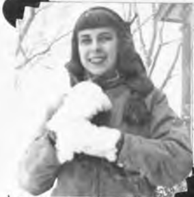
"Cooky that Peperdent Smile."