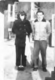
"He's been beating her again"