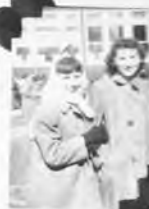
"She's all mine!"