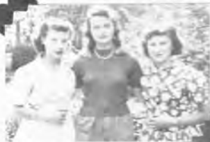
"The Three Musketeers"