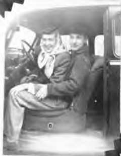
"Two hands on the wheel, please."