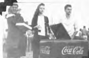
"Eating up the profits"