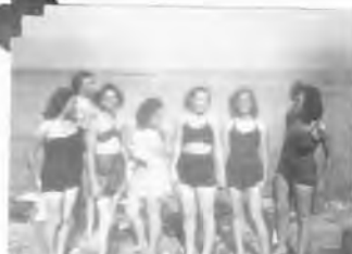
Look - la - la