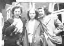
"What's funny kids?"