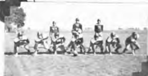
Ready - Set -