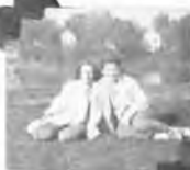
"Holding down the fort"