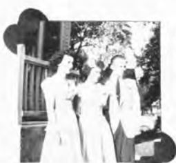
"The Big Event"