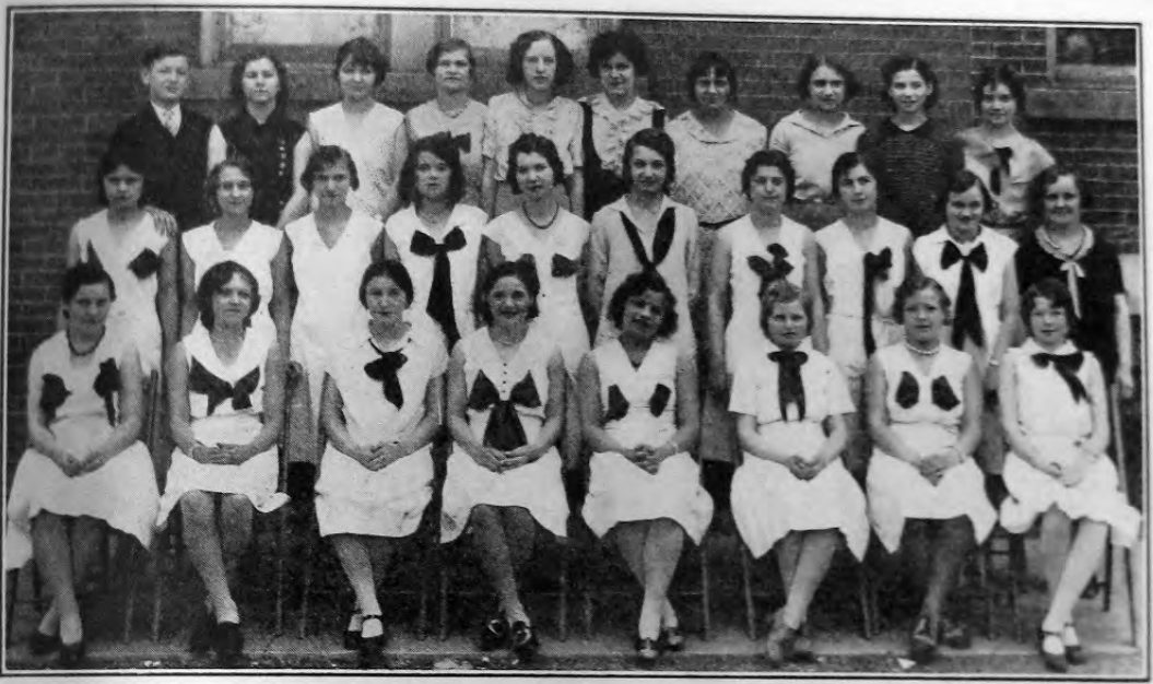
"Our Harmonizers" -- The Glee Club.