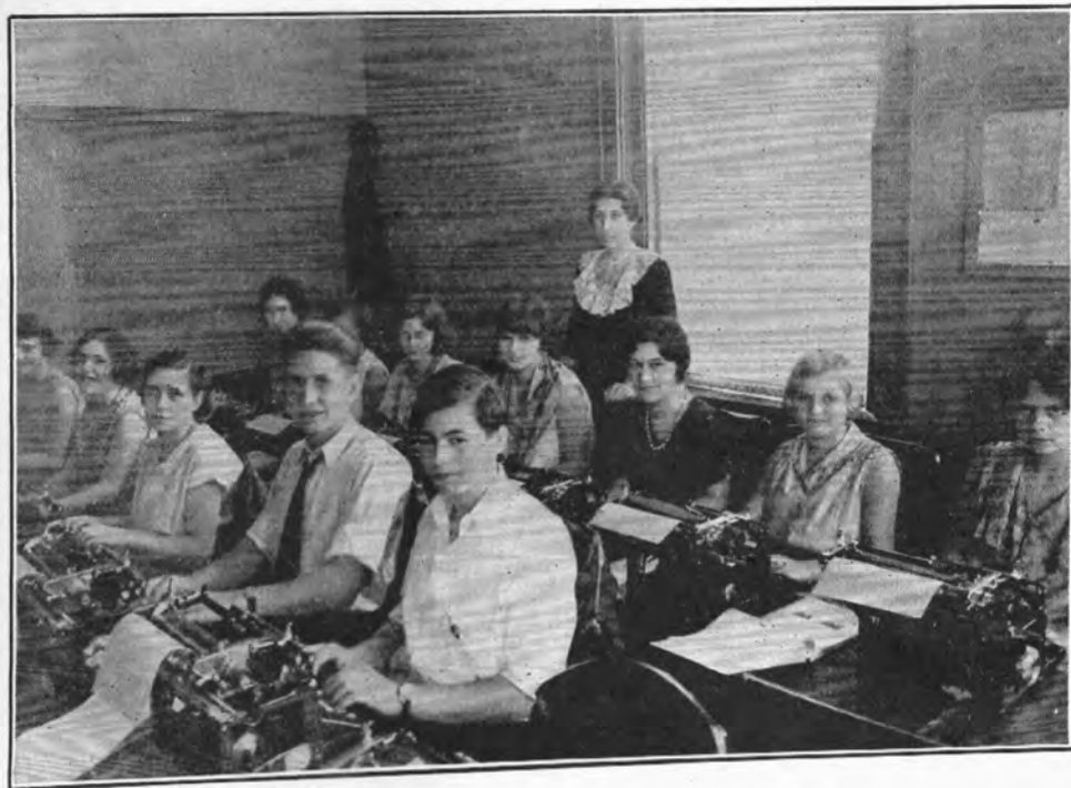
A Typewriting Class Photographed in Action.