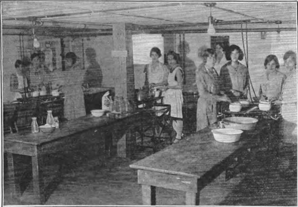
A Class In Foods Home Economics Laboratory.