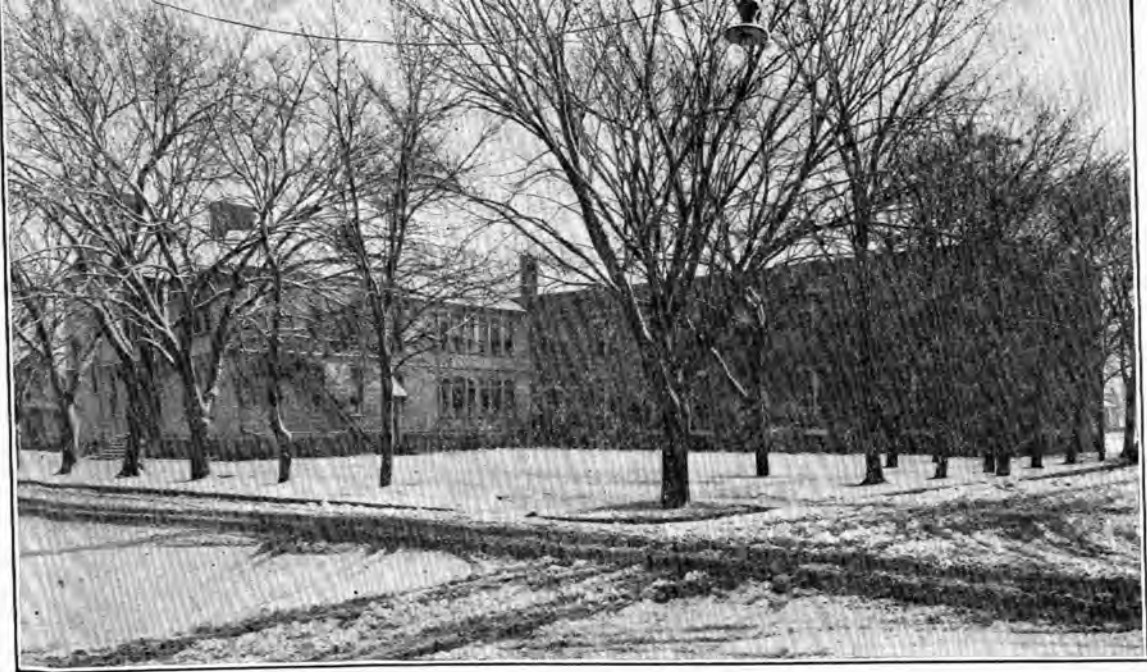
The Bradley Public School Building The Elementary School :: The High School