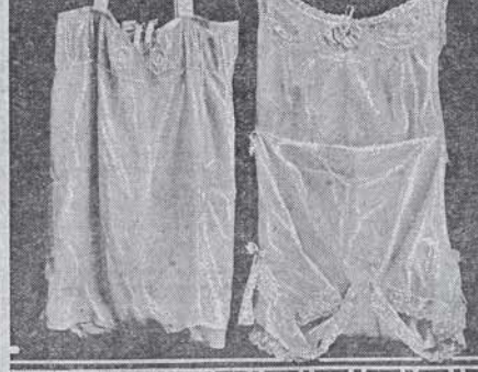
Chemise Has Come Back.

On His Own Hook. The dog stole cautiously into the butcher's shop and bolted with a large piece of meat.