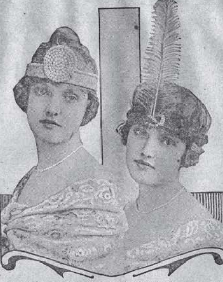
Headresses That Proclaim the Dance.

Headresses for Hours of Merriment That Have Been Carefully Thought Out by Designers—Old-Fashioned and Comfortable Chemise Restored to Favor.