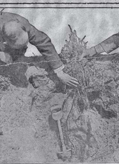
DIGGING TEN-FOOT ALFALFA ROOT.