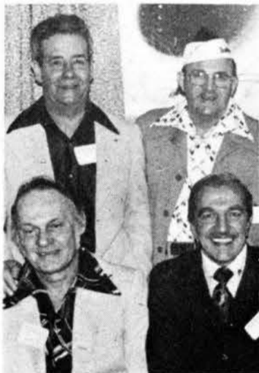
"Hail, hail, the gang's all here." Well, not everybody, but a good percentage of the survivors of Pearl Harbor arrived for a reunion at the Bradley American Legion Hall on March 26. None of the group will ever forget Pearl Harbor, but they can smile and laugh about other things now.