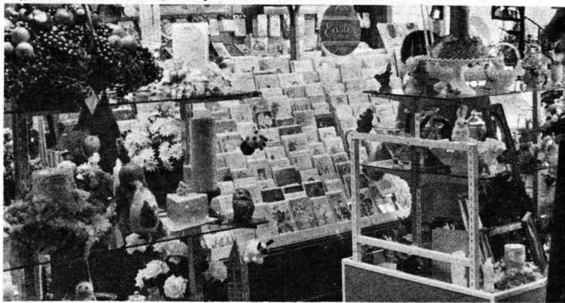
Just a peek at a few of the lovely items available at Gifts N' Things, 1700 West Station Street. The shop has a large selection of greeting cards and stationery as well as fine gifts.