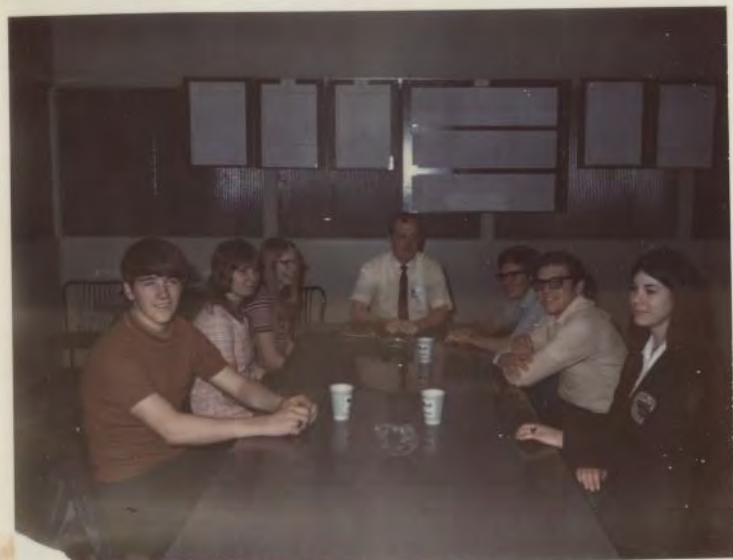
B.I.E. DAY 5/4/71