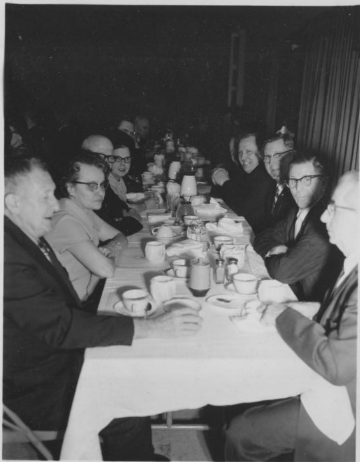
One of the many Tables