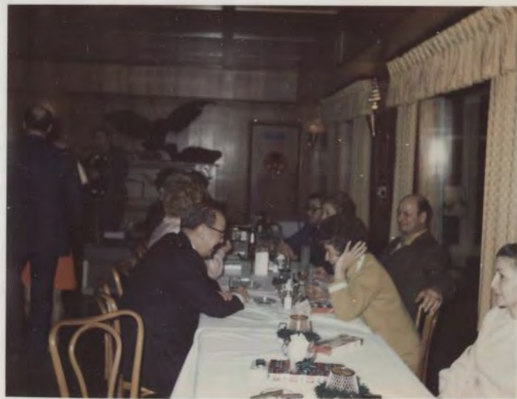
A Funny Story