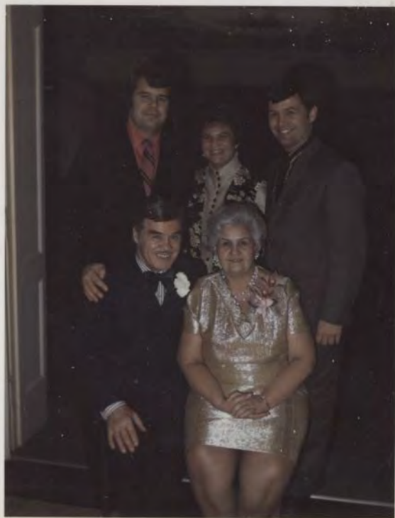
DAD, MOM + 3 CHILDREN