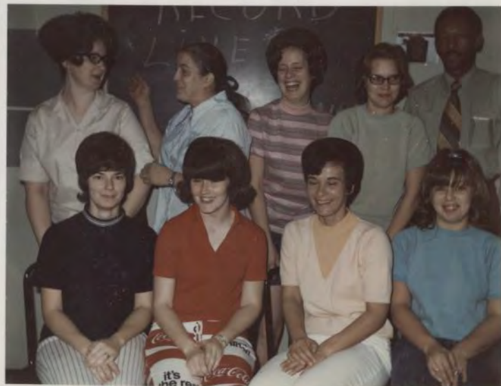
LINE # A New Record