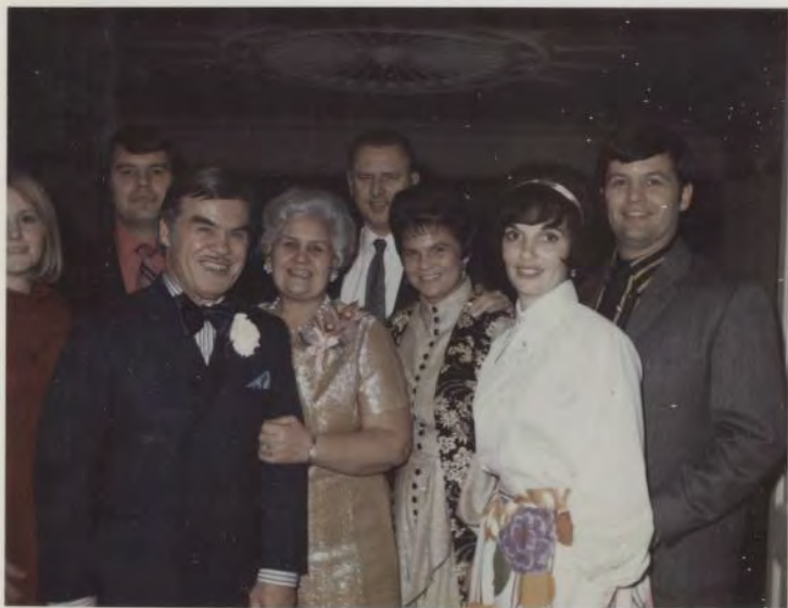
The Family Group