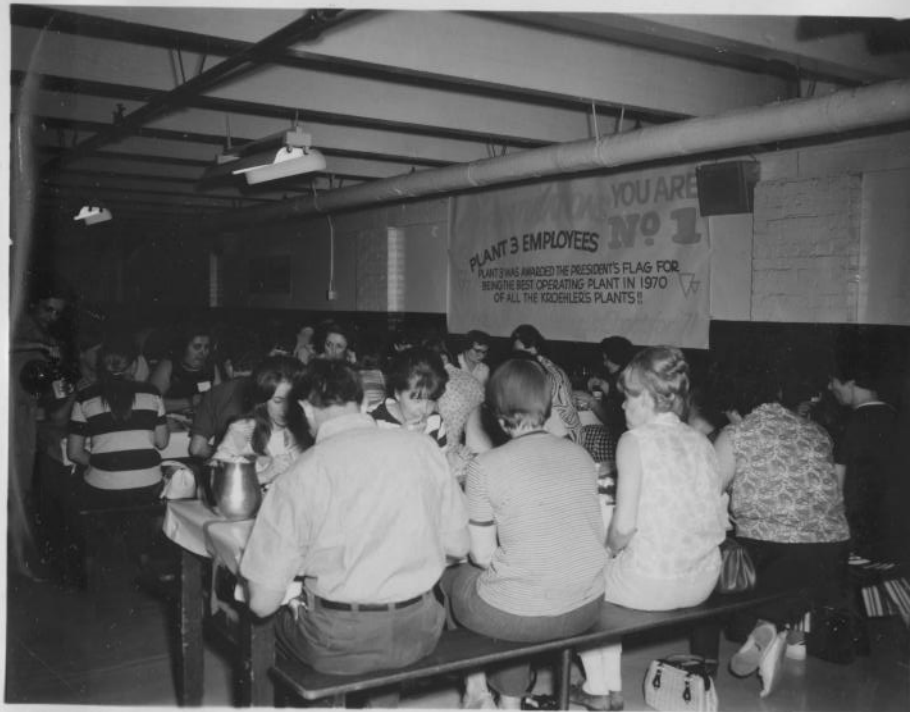
Steak - Baked Potato - Roll - Iced Tea. Coffee - Milk For 360 People In 30 min.