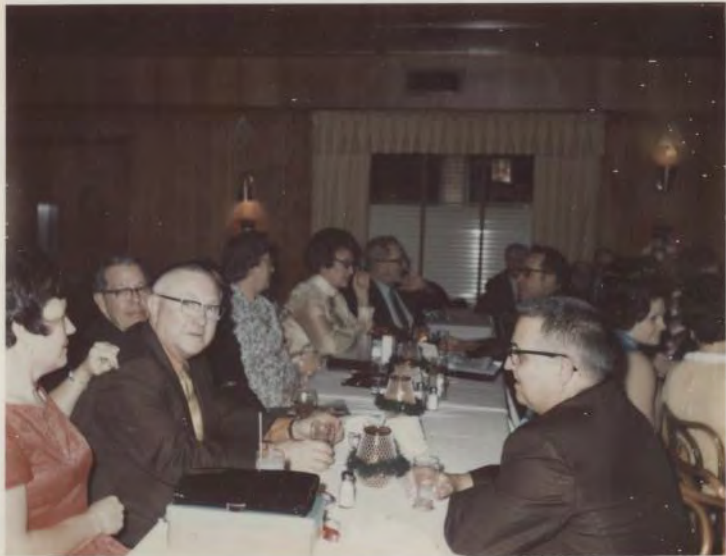
PART of the gang