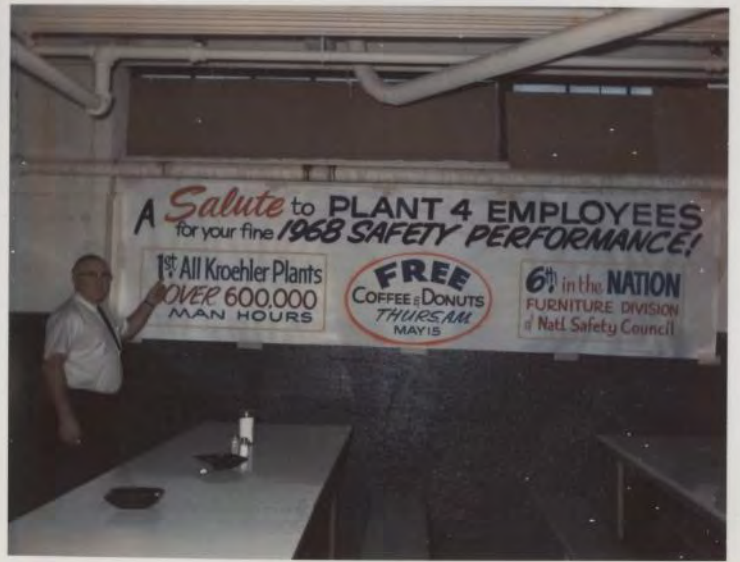
FIRST PLACE "CLASS A" - Kroehler Plants Sixth Place - Furniture Division - N.S.C.