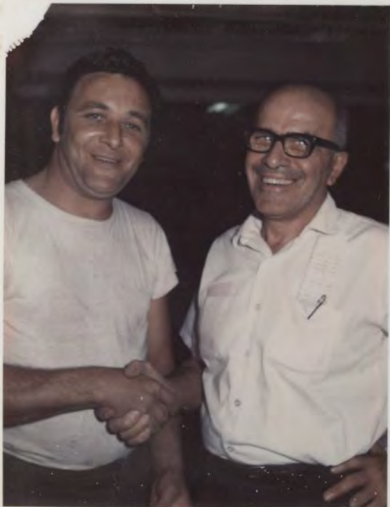
15 YRS SENIORITY DINNER Aug 29 - 1969