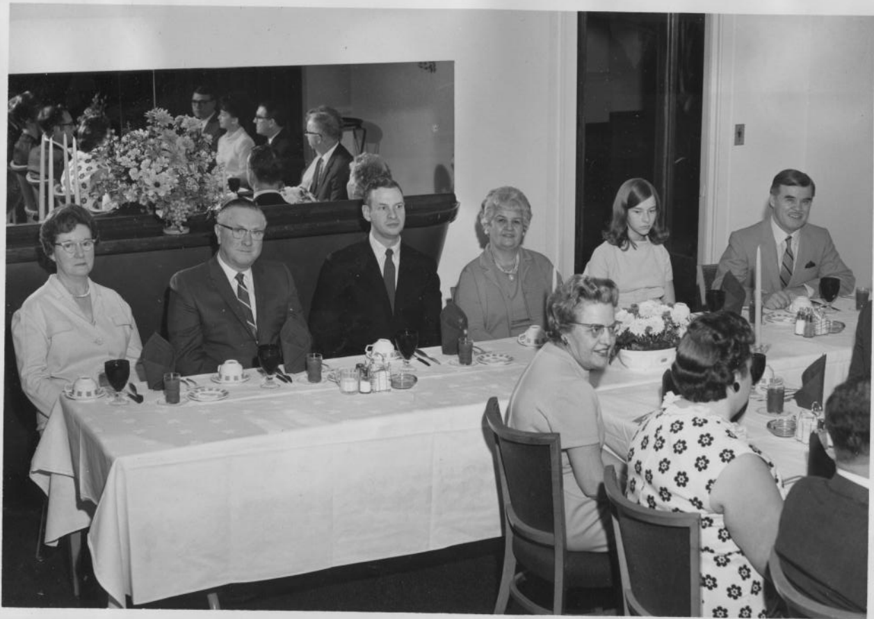
Head Table - Sweepstakes Dinner KANKAKEE Hotel - 4-30-69