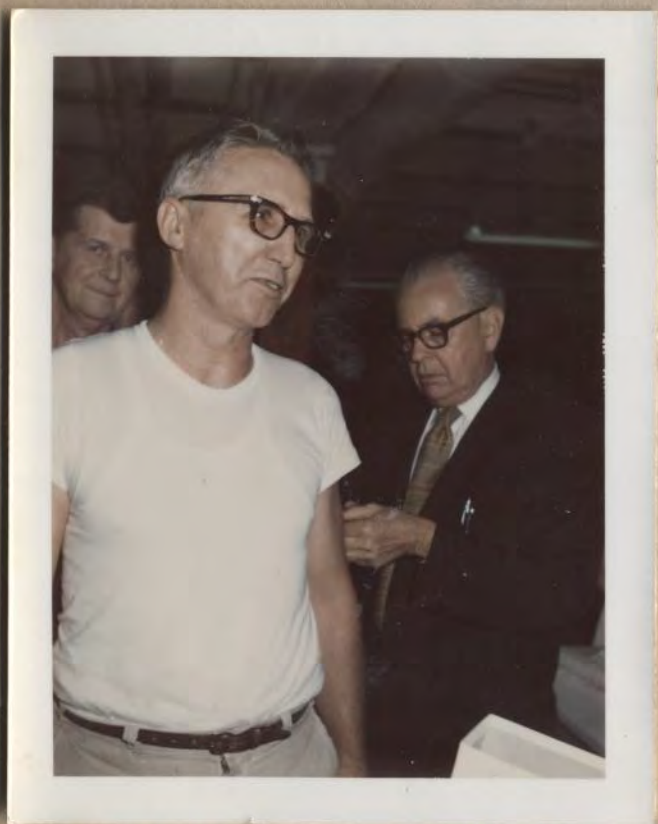
Chester