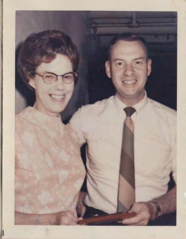
Disability Retirement = 15 YRS