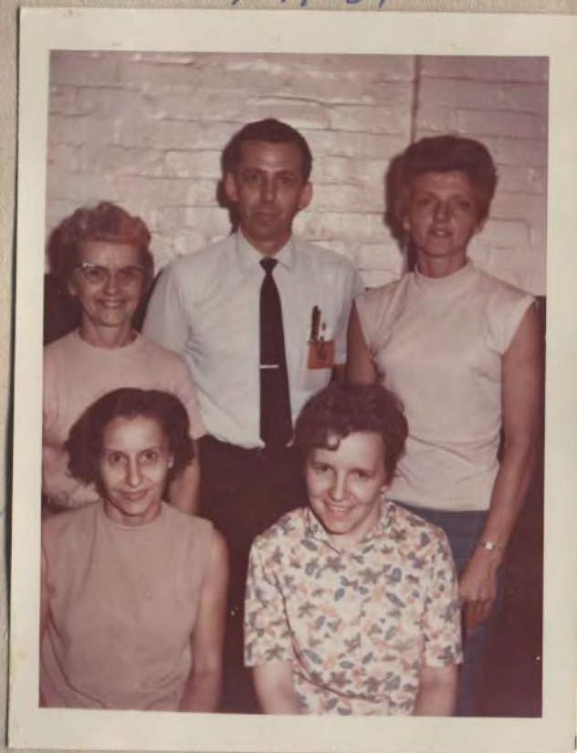
5 YR SENIORITY DINNER