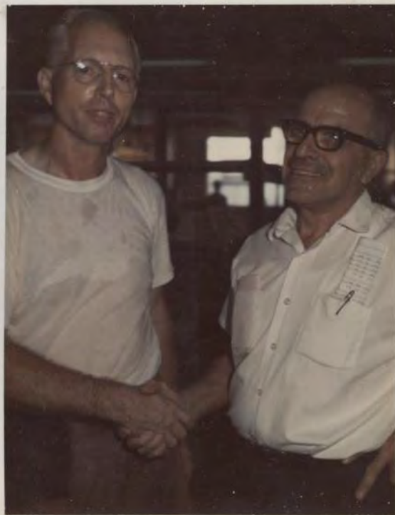
Employee of the Month Sept '69