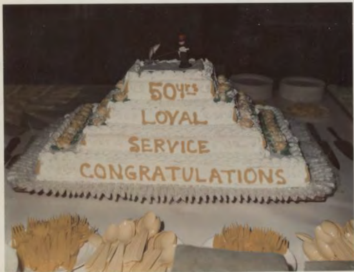
Elmer's Seniority Celebration