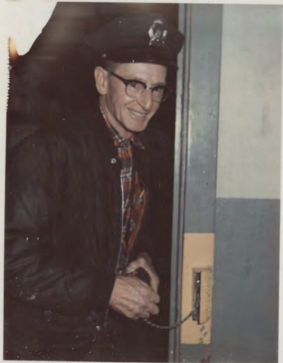
Retirement 12-21-69 - 19 yrs