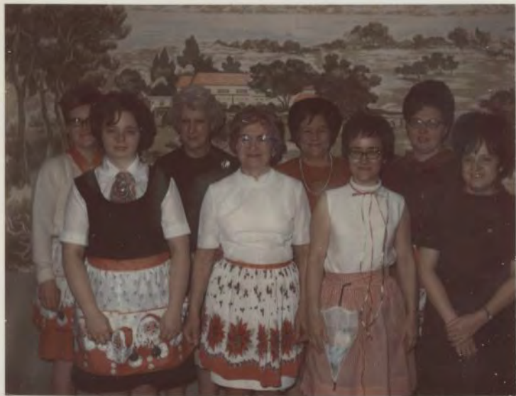
OFFICE GIRLS (WORKERS)