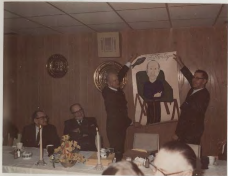
Caricature of "Fish"