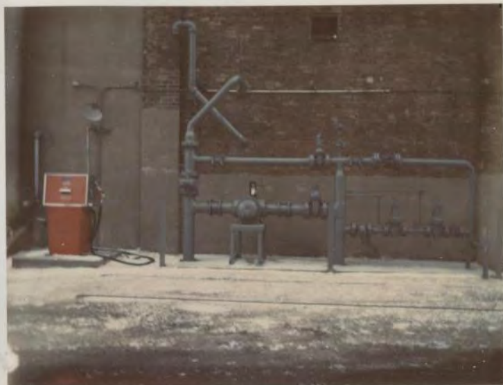
GAS Installation - Outside Piping