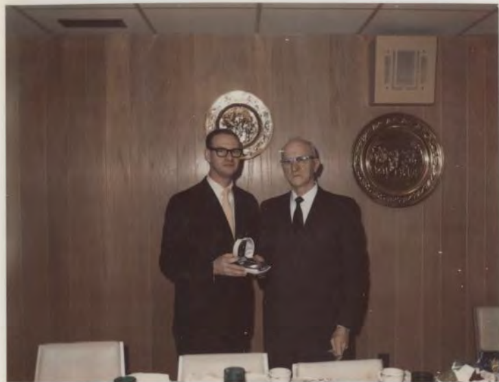
Jim + Fish Watch Presentation