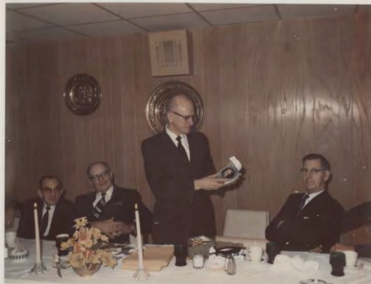
Fish + his Watch