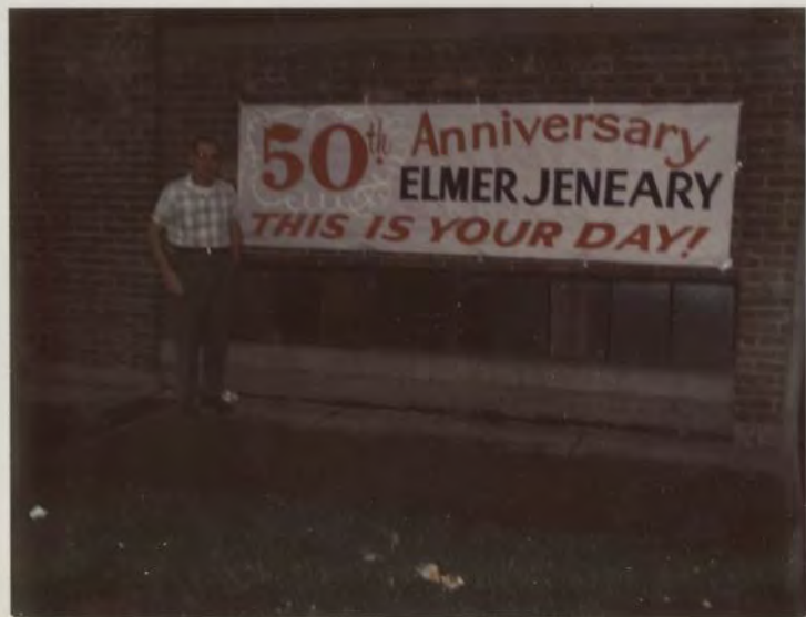
Outside Entrance Sign