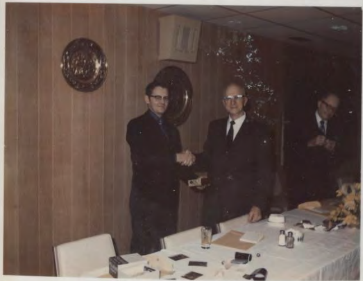
"ORV" + "Fish"