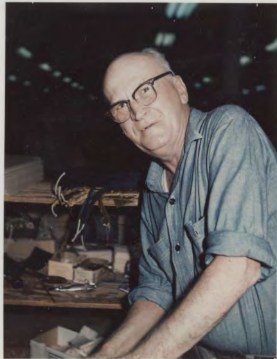
Retirement - 3/4/70 - 40 yrs