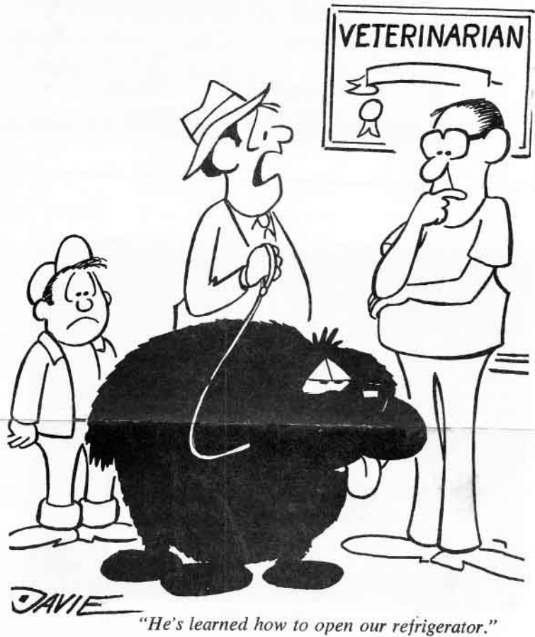
"He's learned how to open our refrigerator."

FOR RENT: One of our employees has space to rent for winter storage of campers, boats, or large equipment. Phone 937-4726.