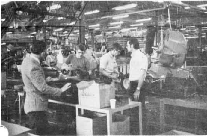
THE MAKING OF A TRACTOR