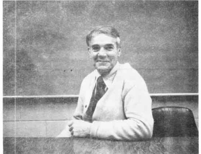
OLD TIMER OF THE WEEK

Splits were picked up by LAFOND 5-10, W. DUPUIS 4-9 and WESTOVER 4-6-10.