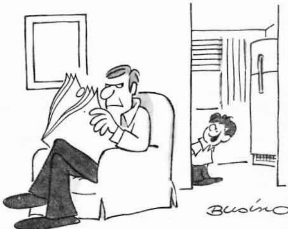
"What wine goes with a peanut butter and jelly sandwich?"