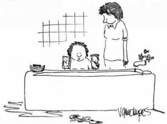
"But how could it be dirty? I just took a bath in it."

The Assembly has taken over the lead from stores and they now have a 4 point lead over the 2nd. place team the Truckers. We only have 2 more bowling nights before the 1st. half position night.