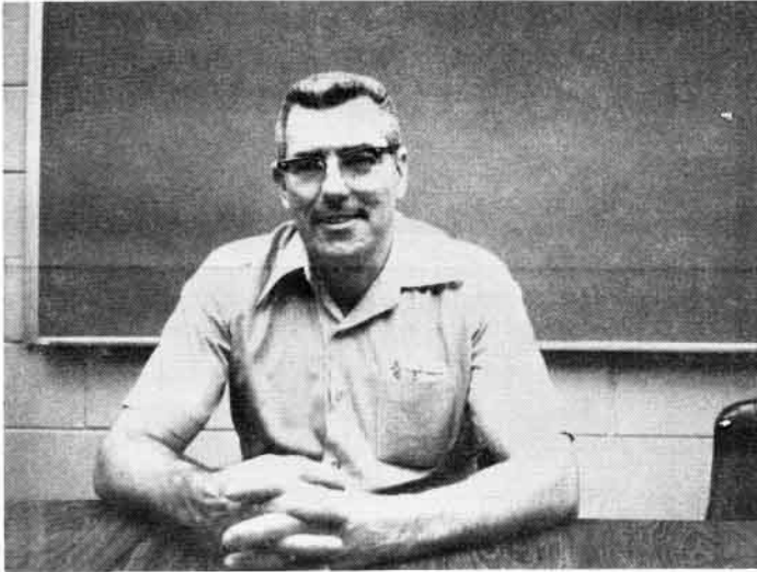
OLD TIMER OF THE WEEK