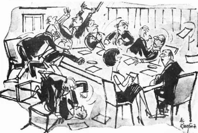
"Let the minutes read, 'discussion ensued!'"

This dependable Old Timer likes to fish, hunt, camp and is a gun fancier. A member of the National Rifle Association, he is especially interested in muzzle loader and flintlock rifles.