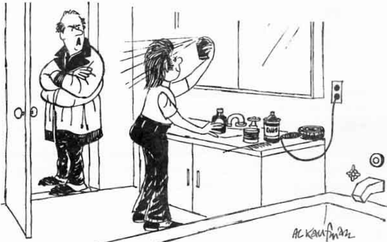
"How much longer until your hair has that natural look?"

The PUFFERS had lived in Limestone for years, but in 1969 they purchased a summer cottage on Bales Lake near Loda. Two years ago they remodeled it and now live there year round which means a round trip each day for LES of over 100 miles, but he says it's worth it. He keeps busy with swimming, fishing, yardwork and fixing up the home.