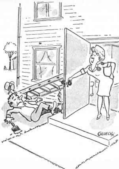
"I'm leaving now for my Hospital Auxiliary stint . . . anything you need before I go?"

This dependable Old Timer lives in rural Bonfield on 3 acres in a home he built himself in 1972. On his estate he has a fishing pond and raises his own beef for the family. He has many hobbies: bowling, carpenter work, travel and gardening. Since 1953 he has been a member of Local 1212 starting at Turks, and is a member of the job group committee.