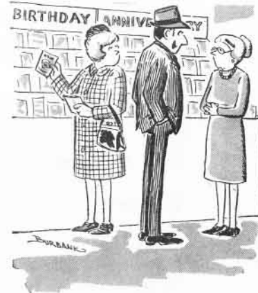
"Do you have a 'Congratulations, Daughter, Now You're The Same Age As Your Mother' card?"