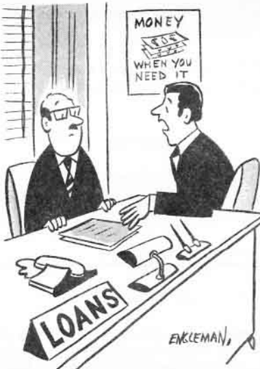
"Can you rush my loan through before the price of everything takes another jump?"

This quiet Old Timer is not one for hobbies preferring to work around the house and garden. Unlike many of his contemporaries he is proud of the fact that, not once in his long career has he lost a single day because of layoff.