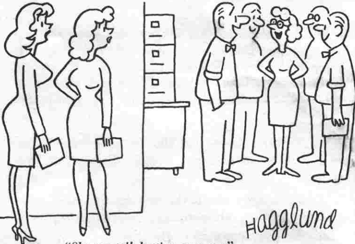
"She can talk batting averages."