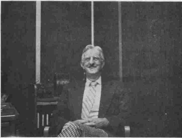
OLD TIMER OF THE WEEK