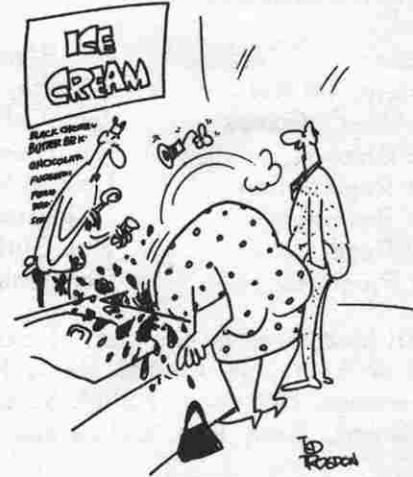
"She finally decided to give up dieting for good."