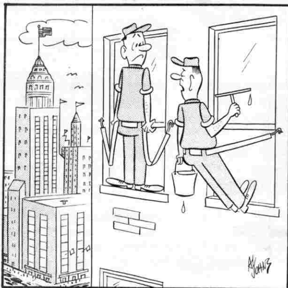
"That's it! Now just kinda fall back."