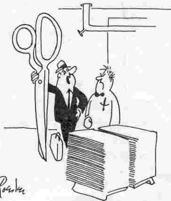
Rosales "We feel we've made a major breakthrough in paper cutting."